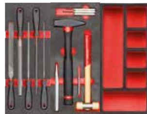
519 M 990A5MD 519 M 382 519 MSK6