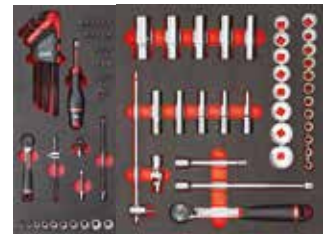
519 M 613AEA 519 M 612CLA