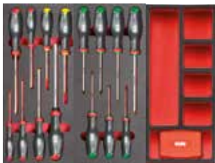
519 M 324H 519 M 324STX 519 MSK6+ 692 J32