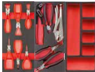
519 M 127C 519 M 150AX 519 MSK6