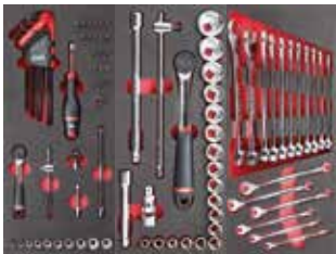
519 M 613AEA 519 M 613CEA 519 M 285A1