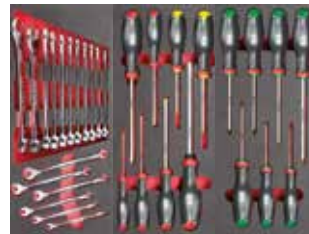
519 M 285A1 519 M 324H 519 M 324STX